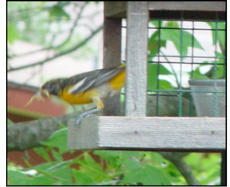
Baltimore Oriole taking mealworms