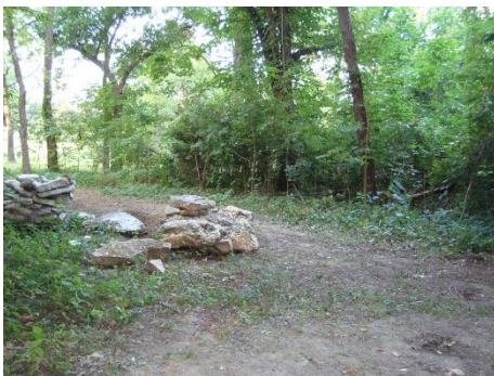
Above : What began as thick , over-grown brush and a pile of rock is beginning to take shape!