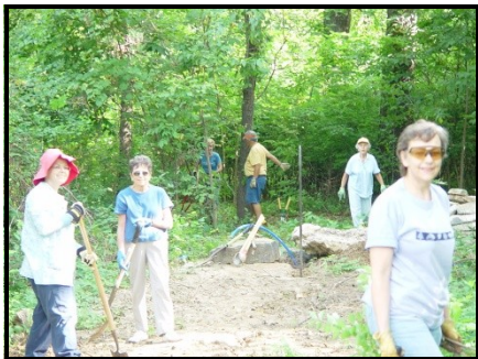
Above: Members of the River Bluffs Audubon society and other local volunteers provided the "manpower" that made this bird garden a reality!