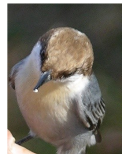
Brown-headed Nuthatch