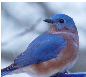
Eastern Bluebird