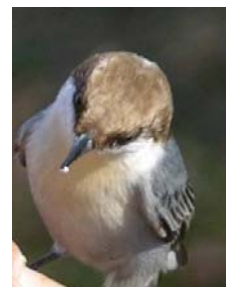
Brown-headed Nuthatch