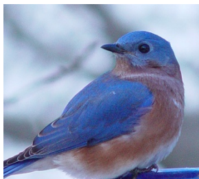
Eastern Bluebird