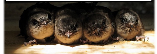
Photo of swifts inside a swift tower.