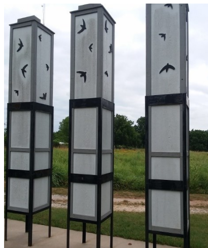
Swift towers at Springfield Bot. Gardens